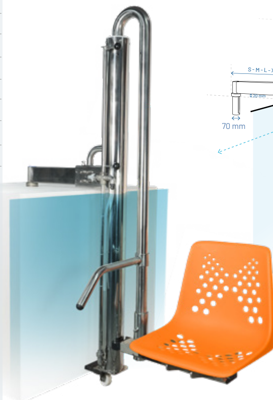
Chair in a water-immersed position.

Ideal for all types of aquatic facilities: from public swimming pools to community or private pools.